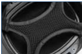
Patented hammock system in knees and elbows for shock absorption and comfort