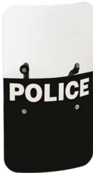
No. 3100 Torso Length Body Shield with black-out