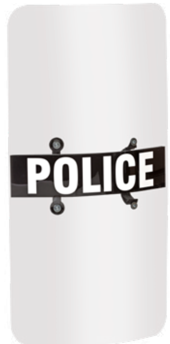
No. 6100 Full Length Body Shield