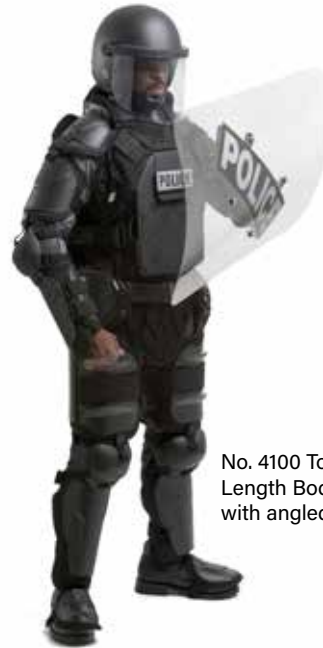
No. 4100 Torso Length Body Shield with angled handle