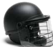
Optional Wire Guard Face Shields provide extra protection