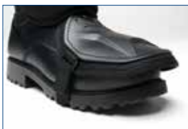
Foot protection straps around bottom of footwear to ensure an extra secure fit.