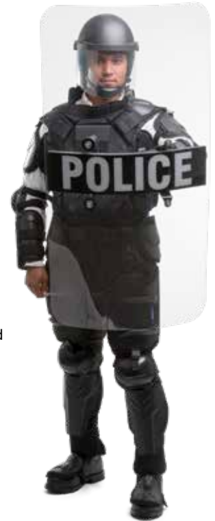
No. 6100 Full Length Body Shield