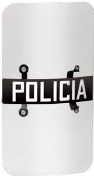
No. 3100 Torso Length Body Shield