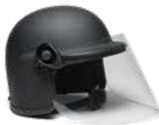
The JCR100 Standard Face Shield will accommodate most gas masks