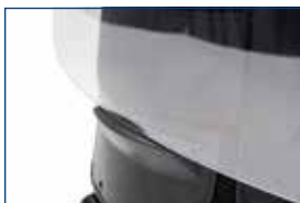
Shelves on thigh plates to rest your riot shield