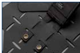
MOLLE System on 45-degree angle for ergonomic, easy access of attached gear