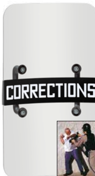
No. 5100 Torso Length Containment Shield