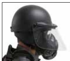
Optional Gas Mask Face Shields will accommodate most gas masks