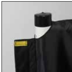
STEP 5 and 6