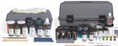
Nos. RAG500 and MNR100 Kits

When the original identifying marks were punched into the metal, the metal's structure deep underneath the markings underwent changes. By treating the surface of the obliterated area, these identifying marks may be restored in many cases. To effect a restoration, an acid solution or gel is applied to the questioned area. This reagent attacks and removes the uncompressed area at a more rapid rate than it does the compressed area,