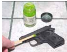
RAG1001 applied to pistol.