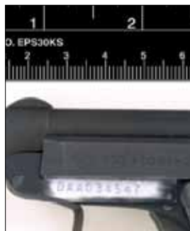
Resultant photograph of the serial numbers restored (NOTE: be certain to include a scale in photo).