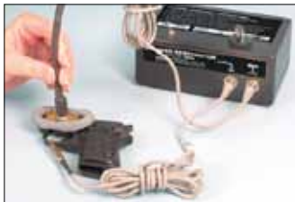
284A is used to restore serial number of handgun.