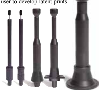
Nos. (L to R) 125LM, 125L, 125MD, 125MBA, 125GM

Although our applicators can be used with any brand of magnetic powder, we recommend the use of quality SIRCHIE magnetic powders.