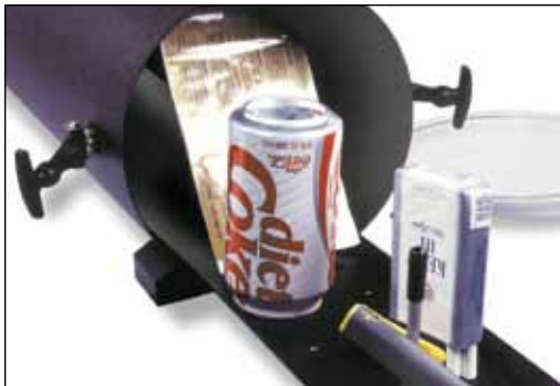
No. CNA2000 FINDER™ packet is used to fume evidence in No. VAC250 CYANOVAC II Fuming Chamber.