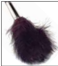
No. 123LBW Black Whopping Marabou Feather Duster