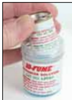
Place activator canister into jar of activator solution.