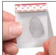
No. 130LW Fingerprint Hinge Lifter features a built-in backing sheet.