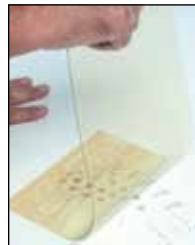
No. GLT401W is ideal for lifting dust prints.