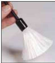
No. 122L Standard Size Fiberglass Brush