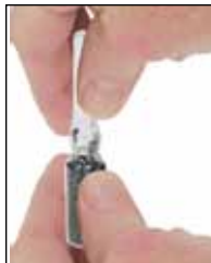
Hold ampoule between forefinger and thumb of each hand and break at score.