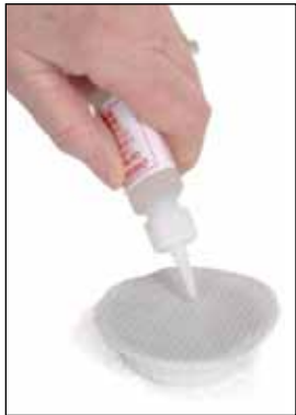
No. CNA102 is placed on a CNA104 Dispersal Pad.