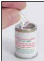
Empty iodine crystals onto metal top of activator canister.