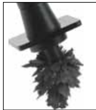
No. 125MBA Magnetic Burnishing Applicator