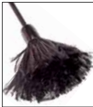
No. CFB100 SEARCH® Carbosmoove I Brush