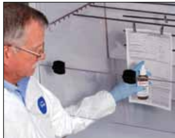
Use DFO in well ventilated area or fuming hood.

DFO is a Ninhydrin analog that reportedly will develop 2.5 times the number of prints as Ninhydrin alone. SIRCH-IE provides DFO in a liquid spray as well as in crystal form for those wishing to mix their own formulations. DFO exhibits many of the same characteristics as Ninhydrin, including the fact that it reacts to amino acids. DFO should be used only in an area with adequate ventilation or under a ducted or re-circulating fuming hood as shown to the left. Wear rubber gloves to avoid staining of your fingers, and to prevent absorption of any of the chemical solvents present.