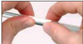
Protective paper sleeve allows you to break ampoule safely.