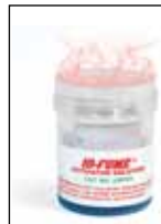
Fumes should take place within one minute.