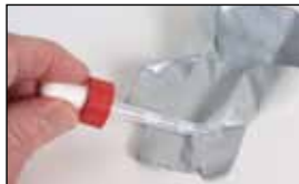
No. TRA20 facilitates tape separation.

NOTE: If the tape is wadded up and stuck together, several methods are available to loosen the adhesive. No. TRA20 Adhesive Tape Release Agent (shown to the right) may be used without destroying latent prints that may be present or the tape may be sprayed with liquid nitrogen. Some report that leaving the tape in a deep freezer overnight will also serve to kill the adhesive for a brief time.