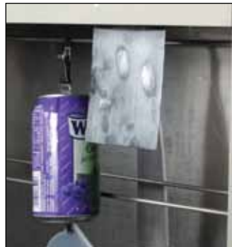
The control prints serve as an indicator for adequate fuming time.

Another method of cyanoacrylate fuming that produces excellent results is fuming in a vacuum chamber such as No. VAC250 shown above. Consult the appropriate Technical Information bulletin.