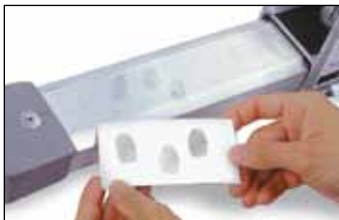
No. 127LW Rubber/Gel Lifter is useful on irregular surfaces.

When viewing the lift through the clear plastic cover, the image will be reversed . Rubber lifters are available in opaque black and white. GELifters™ are available in black, transparent and white.