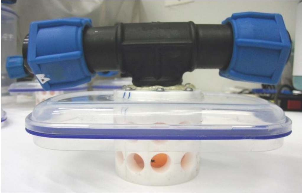
Figure 4. Blood container collection lid with float-valve shut-off device.