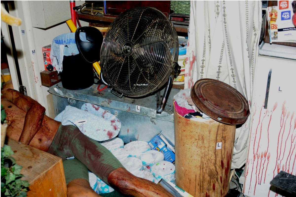
Figure 1. View of victim on floor of bedroom.

The victim was discovered in a supine position with his body rolled towards the right hip. He was clad only in a pair of green shorts and was barefoot. Bloodstains were present on the visible areas of his body and the front of his shorts. Arterial bloodstains were present on surfaces near his body which included the front door of a small refrigerator, a cylindrical clothes hamper, a curtain and miscellaneous materials (Figure 1). The arterial patterns could be traced from the bedroom, through the hallway (Figure 2), and to the front room. Arterial patterns with altered flow patterns were observed on the inside of the front door (Figure 3).