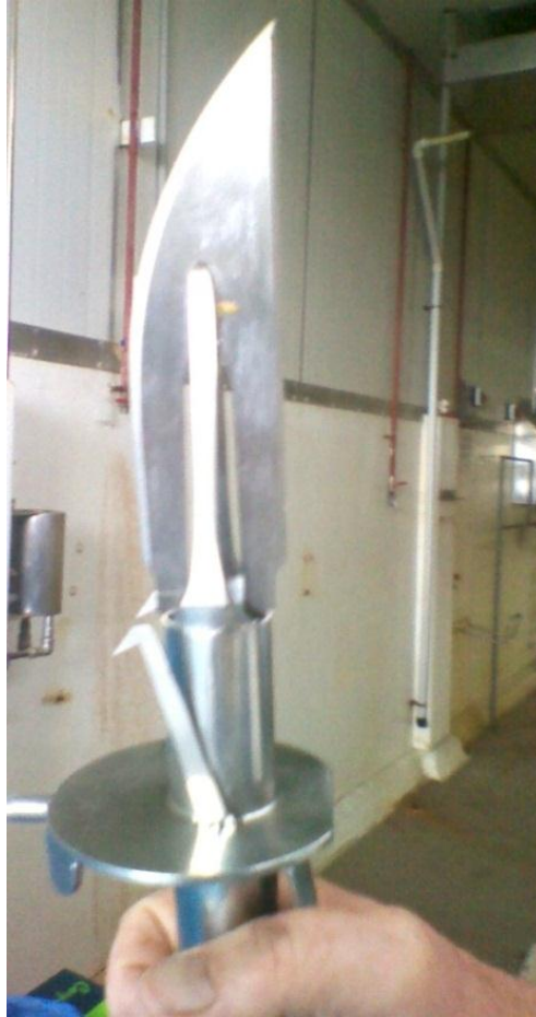
Figure 2. Close-up perspective of Vampire knife blade.

The basic requirements of this passive flow system were to direct blood smoothly from the blood vessels in the pig's neck into a containment vessel containing anticoagulant. To ensure the correct ratio of anticoagulant to blood, a float valve apparatus was installed at the junction between the collection tube and the container to shut off the blood flow when the correct volume was reached.