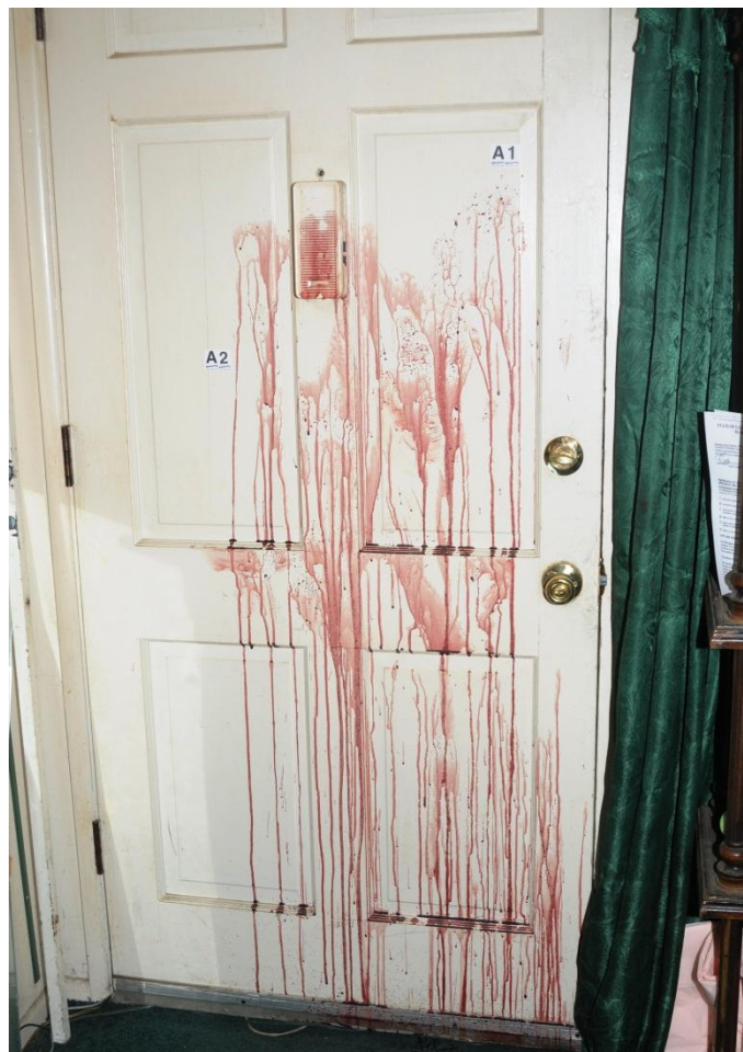
Figure 3. View of arterial bloodstain patterns on interior of front door.