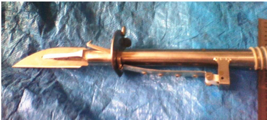
Figure 1. Vampire knife with a 32 mm tube placed over the end of the hollow handle.

In commercial abattoirs, pigs are usually exsanguinated using a sharp knife which is inserted into the thoracic inlet to sever the major vessels of the neck. The knife is immediately pulled away leaving the blood to drain freely. The abattoir assisting with this project made available to us a hollow blood collection knife known as a ‘vampire knife’. The vampire knife is 40 cm long with a hollow handle and designed for the commercial collection of blood for human consumption [6] (Figures 1 and 2). When a vampire knife is used, the blade is inserted into the animal’s aorta, blood flows down the knife blade, through the hollow knife handle and into a tube. The knife is designed to minimise leakage around the insertion point. A 32 mm diameter hose attached to the handle end allows the blood flow to be directed into a collection container. Incorporating the vampire knife into the design of our blood collection device provided the opportunity to develop a relatively closed collection system.