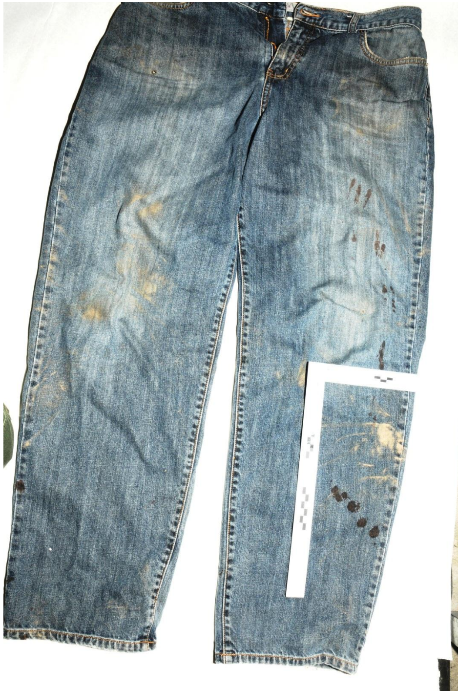
Figure 4b. View of arterial bloodstain pattern on the front of the jeans of the accused.