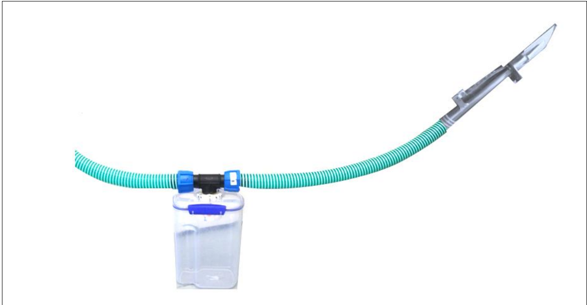
Figure 3. Assembled passive flow collection system.

The float valve (Figure 5) comprised a rubber O-ring (a) fitted inside the lower portion of the acetal bracket (b) and a table tennis ball (c) inside an acetal cage (d) on the underside of the container lid (e). When the blood volume in the container reaches the desired maximum level, the table tennis ball is pushed upwards onto the O-ring, creating an effective seal and stopping any further flow. Excess blood still flowing from the pig bypasses the collection container, flowing out the opposite side of the T-piece through a further length (40 cm) of hose, directed back to the abattoir waste collection system. Two 6 mm holes drilled into the container lid allowed air to be displaced as the container filled.