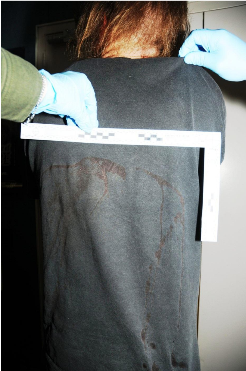
Figure 4a. View of arterial bloodstain pattern on the rear of the shirt of the accused.