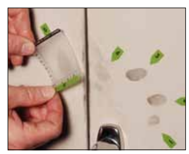
THREE: Apply the lifter with the corresponding number by smoothing it over the developed print. The optically clear lifter makes placement easy and precise