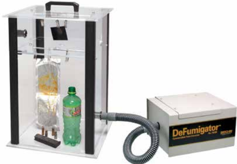
The FR300 DeFumigator™ extracts noxious odors and fumes from CNA900.

inside the chamber are drawn through a >99% efficient filtering system comprised of a HEPA Filter (FR301) and a Bonded Carbon-Activated Filter (FR302)..