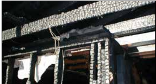
Heavy alligatoring is indicative of intense burning.

NOTE: Take several readings within a small area since the probe may strike a nail or wood knot on the first attempt. All readings within a few measurements of one another should be reasonably close.