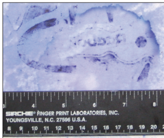
Fingerprint on cloth.