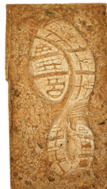
Fig. 6—Resulting Cast