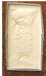
FIG. 5B—Dental Stone