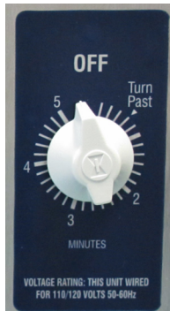
The Timer Control, located on the rear of the unit allows for setting the evacuation time.