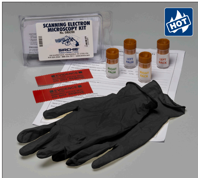
No. GRA200 Primer Residue Collection Kit for SEM

This collection kit contains all the necessary items to recover residue from a suspect's hands or clothing. Items should then be sent to your lab for the SEM test.