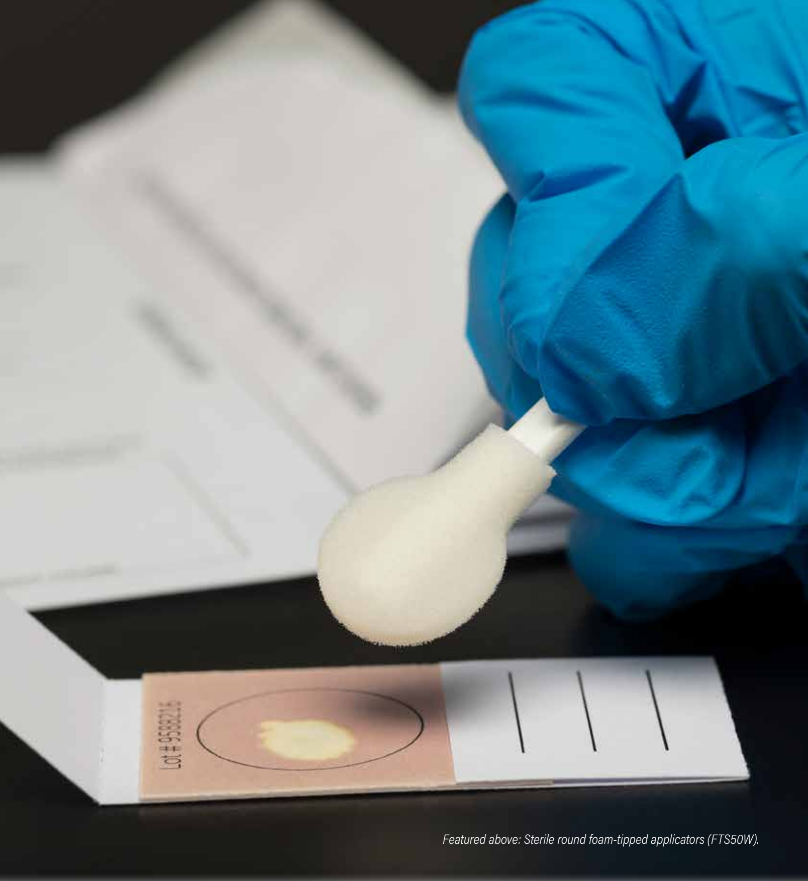
Featured above: Sterile round foam-tipped applicators (FTS50W).