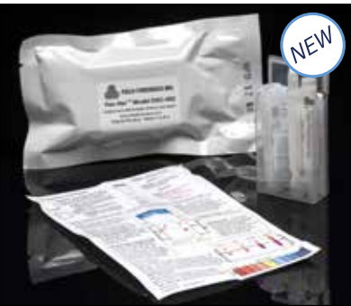
No. NARK200FENHER Fen-Her™ Fentanyl/Heroin Test Kit, 5 tests

ZONES - fentanyl and heroin appear in zones. The actual position heroin and fentanyl can vary vertically. The ZONES are marked on the inside of WRAPPER to be used as a visual guide.