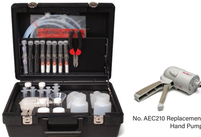
No. AEC210 Replacement Hand Pump

This kit allows you to extract large and small liquid samples using the included hand pump to collect liquids from up to 10 feet away, syringes to collect samples from cracks and crevices, and petroleum strips and pH litmus strips.