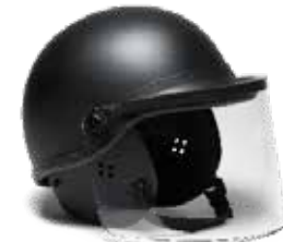
906 Series TacElite EPR Polycarbonate Alloy Riot Helmet