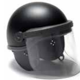
900LT Series TacElite EPR Polycarbonate Alloy Riot Helmet