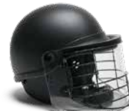
906 Series TacElite EPR Polycarbonate Alloy Riot Helmet with Wire Guard