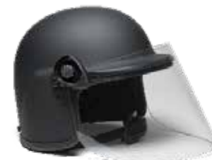
JCR100 TacElite TCM Fiberglass Riot Helmet