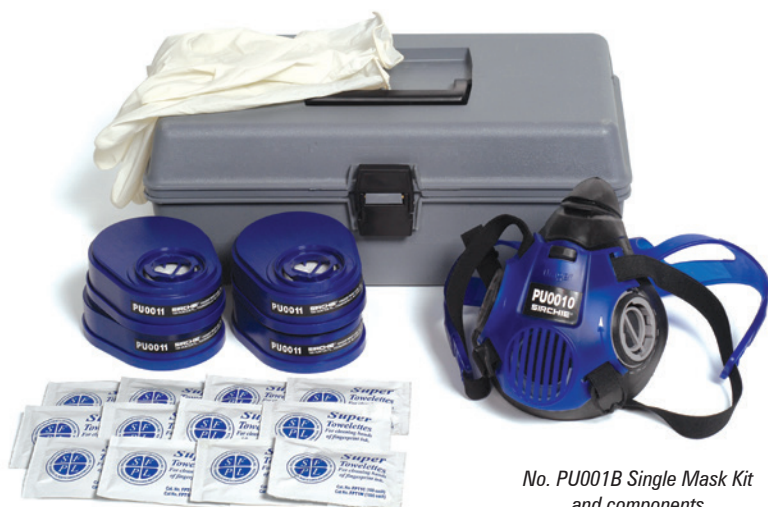
No. PU001B Single Mask Kit and components

These low maintenance, reusable masks weigh less than 1/2 lb. and are made to fit any head size. Filtration is supplied by a chemically treated filter that has been NIOSH/MSHA approved for organic vapors, chlorine, hydrogen chloride, chlorine dioxide, and sulfur dioxide. The easy-to-use sliding suspension system makes them comfortable to wear. All masks are NIOSH/MSHA approved. Only one mask per person is recommended to eliminate the diseases spread by sharing face pieces.