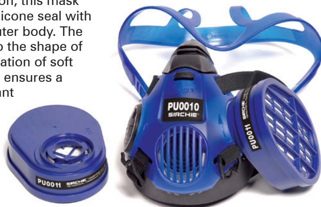
No. PU0010 mask with PU0011 filters

Designed for applications that do not require full face protection, this mask combines a latex-free silicone seal with a formed plastic shell outer body. The soft silicone conforms to the shape of every nose. The combination of soft silicone and hard plastic ensures a comfortable, leak-resistant fit to a typically hard-to-fit area. The compact and lightweight unit is excellent for use at the crime scene where decaying matter and hazardous vapors may be present.