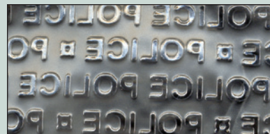
No. SF0075 (Closeup of embossed sole).