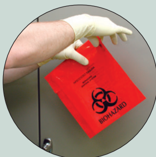
Fold over adhesive flap, seal and dispose of bag properly.