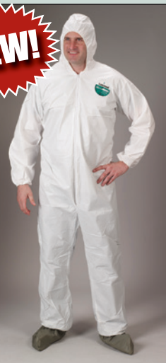
Lakeland MicroMax NS Coveralls w/hood, elastic wrist & ankle