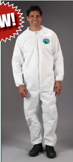
Lakeland MicroMax NS Coveralls w/elastic wrist & ankle