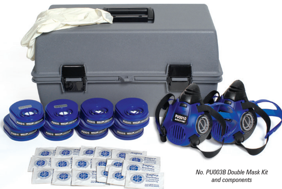
No. PU003B Double Mask Kit and components