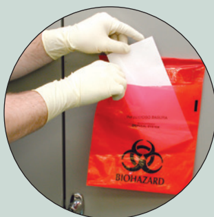
Insert biohazardous waste.