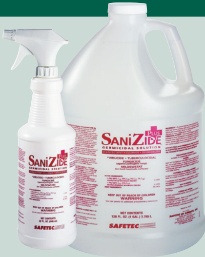
No.'s DC32 & DC128