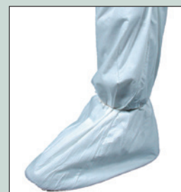
No. TYV200 Disposable Protective High-Top Boots.