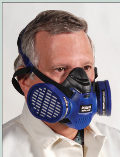
No. PU0010 with PU0011 filters

Multi-Purpose Mask with 3 filter choices!