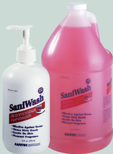
No.'s AH16 & AH128