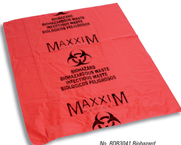
No. BDB3041 Biohazard Disposable Bag