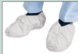
No. SF0073 Disposable Shoe Covers.