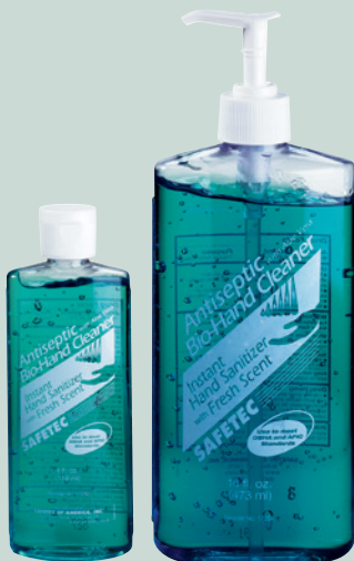
No.'s ABC4 & ABC16