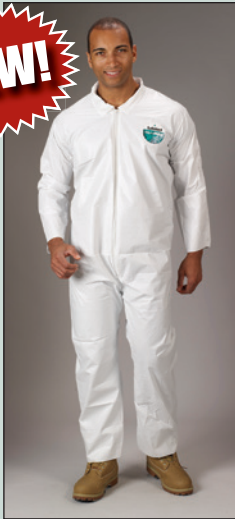
Lakeland MicroMax NS Coveralls