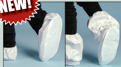
No. SC100LXL MicroMax NS Shoe Covers