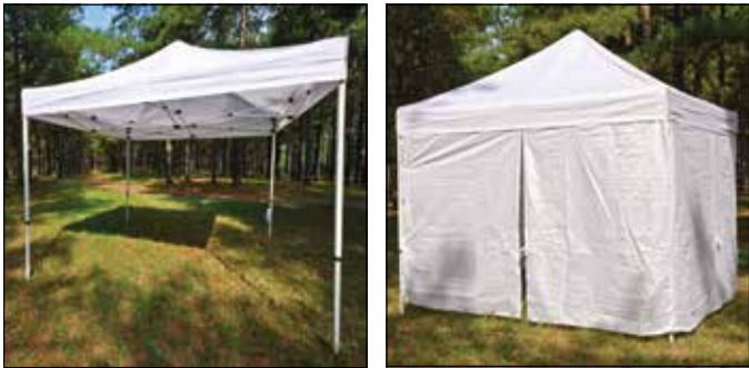
The Scene Cover Tent can be set up by two people in mintues, and can be purchased with or without walls.

Preserve the integrity of your investigation and keep evidence protected from weather and curious onlookers. Tent fabric is fire resistant 500D polyester, and the frames are made with aluminum for light weight or steel frames for strength. The tent's legs and frames are not susceptible to rust and are built for rugged use. Tents are 10' x 10', and available with or without detachable walls. All Scene Guard tents include a roller bag with wheels for easy transport and storage.