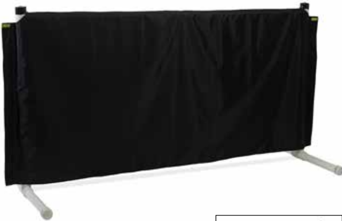
Double the height of your Scene Guard with the Height Extension Kit (No. SCGD20XT)

Protecting the crime scene and preserving evidence sometimes means preventing the public from viewing the scene. Scene Guard is a portable, rapidly assembled privacy screen that shields the scene from the public view and lets medical personnel and investigators operate more securely. Double the height of your Scene Guard with the Height Extension Kit (No. SCGD20XT).