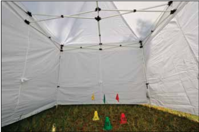
The Scene Cover Tent features a spacious 10' x 10' interior (four-wall version pictured).