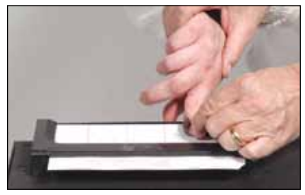
FIG. 4—Record the print in the space provided on the record card.