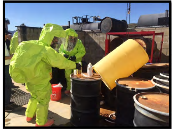
Level “A” Suits