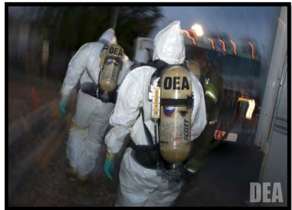
Level “B” Suits