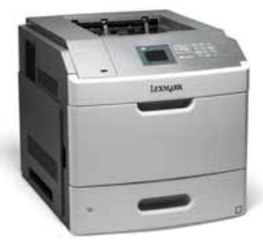
Card Printing Software and Printer