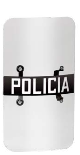
No. 3100 Torso Length Body Shield