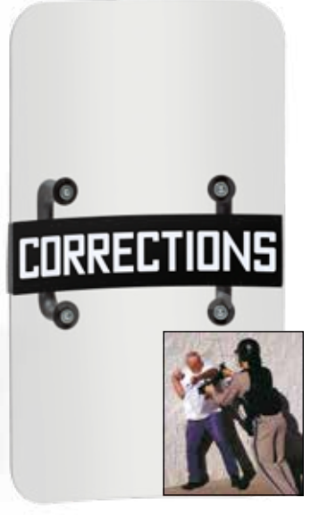
No. 5100 Torso Length Containment Shield