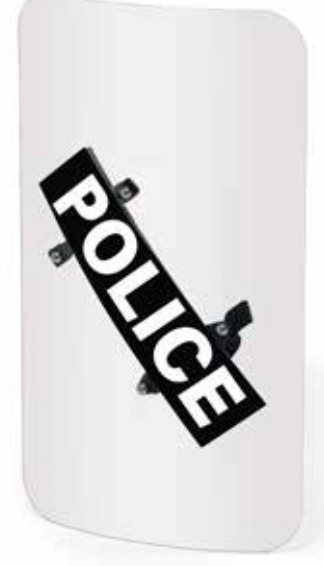
No. 4100 Torso Length Body Shield with Angled Handle