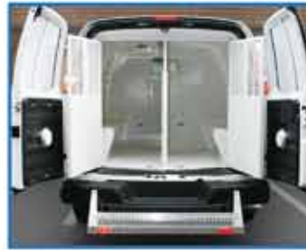
Supplied Standard with an Inner Security Door for Maximum Officer Safety. Optional Two Compartment Configuration Pictured.