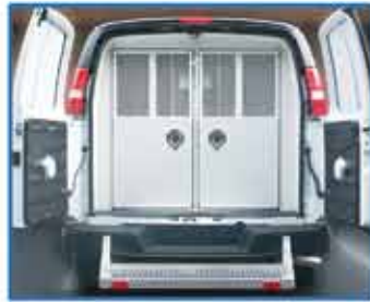
Heavy Duty Aluminum Diamond Plate Rear Step to Accommodate Prisoners with Leg Shackles.