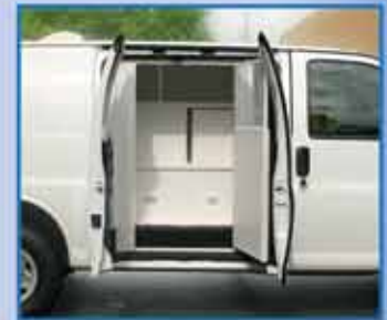
Optional Maximum Security Cell for Special Needs Prisoners.