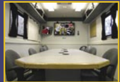
Conference areas sized and equipped based on individual agency requirements. Large screen monitors, command boards, etc. available.