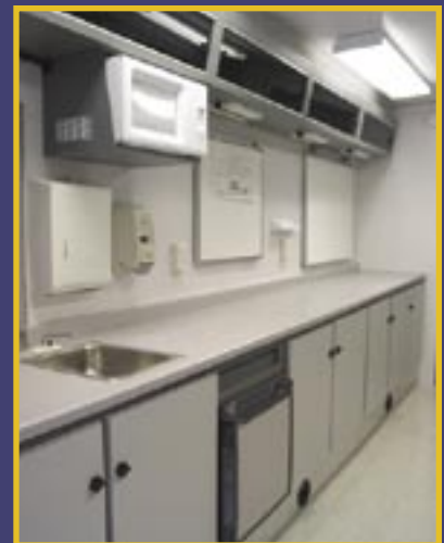
Fully functional, easy-to-maintain galley.

For drawings and the Grant Coordinator for your area, contact our Technical Sales Department at: (800) 545-7375