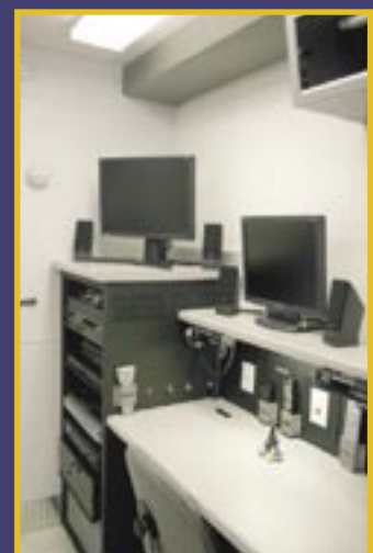
All radio and communication requirements addressed on an agency-by-agency basis.

Visit us on the web at: www.sirchienj.com