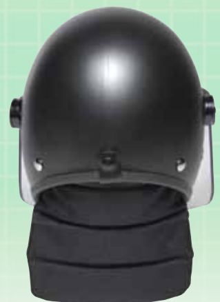
Rear view of Model FXR2000LT.