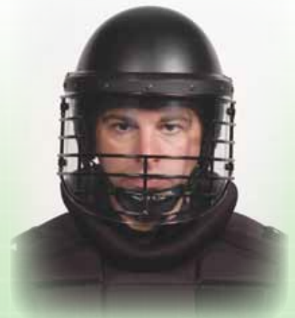
Front view of Model FXR2000LTC.