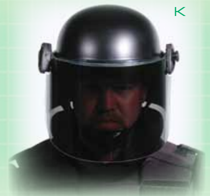
The JCR100 is pictured with the SLC5 smoke lens cover.