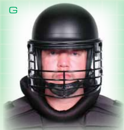
Front view of model 906C.