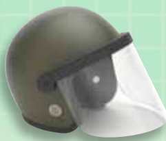
Olive Drab Green