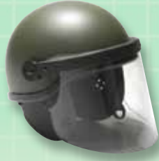
Olive Drab Green