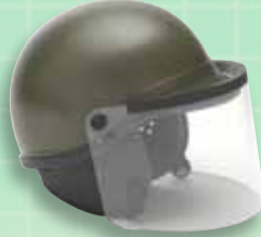
Olive Drab Green