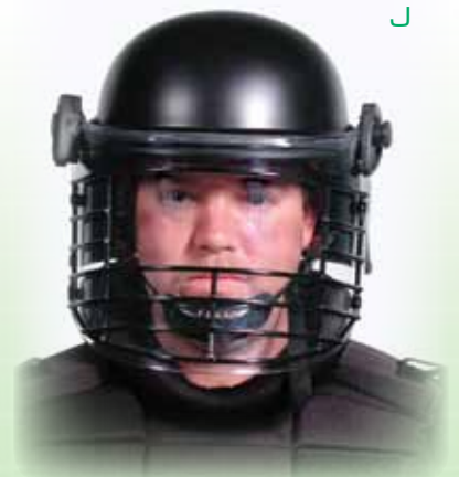
Front view of Model JCR100C.