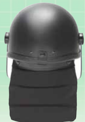
Rear view of Model 900LT with nape pad.