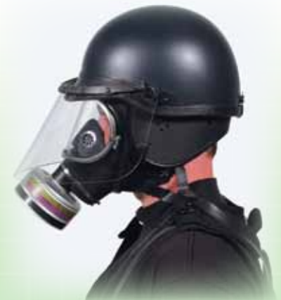
Model 906FS6 pictured with PC1000 gas mask.