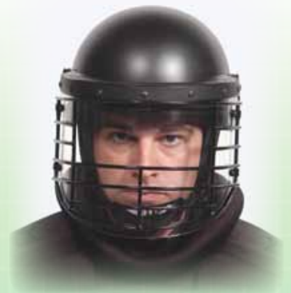
Front view of Model 900LTC.