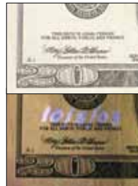
Twenty dollar bill treated with No. UV734 as viewed in natural light (top) and UV light (bottom).