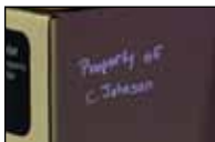
A mark made on a cardboard box with No. UV700 as viewed under UV light.

This detection powder can be sprayed on any surface, and it leaves an invisible film that is immediately transferred to hands or clothing when touched. CLUE SPRAY™ is suitable for large and small objects. It is highly fluorescent when exposed to UV light but invisible to the naked eye.