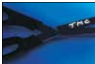
Scissors marked with No. UV7311 viewed under UV light.