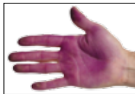
Resulting effect on a hand that came into contact with an object treated with No. VS301 after exposure to moisture.

A transparent fluid that is easily applied to any surface, this fluid will not dry for at least ten days because of its viscosity. This fluid's reaction with salts exuded in perspiration causes stains on the hands of the suspect. Exposure to natural light accelerates the brown or black staining of the hands. Stain color will remain on the skin for a period of at least five days and cannot be washed off. Apply to any nonporous surface with a cotton swab.