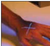
Invisible skin marking ink is visible when exposed to UV light.

No. UV743E dries immediately with no visible trace. It fluoresces a brilliant blue/white when exposed to longwave (UV) radiation. The combination of fluorescent invisible skin ink and ultraviolet light is one of the easiest methods of controlling access or egress from facilities such as prisons, detention houses and other control areas.