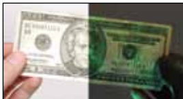
Twenty dollar bill (treated with CLUE SPRAY™) as it appears under normal light (left) and UV light (right).