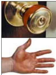
Doorknob treated with No. VST313 (top) and contact result on hand after exposure to moisture (bottom).

A visible stain powder should be selected based on its natural color blending with the color of the target object. It should be carefully dusted on the object