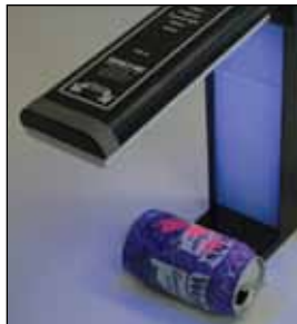
Fluorescent Powder Illumination

The exterior of the unit can be cleaned using a damp cloth. Do not allow water to enter the inside of the unit. Note: Should any other problems arise, contact the factory (Customer Service) for return authorization at (919) 554-2244.