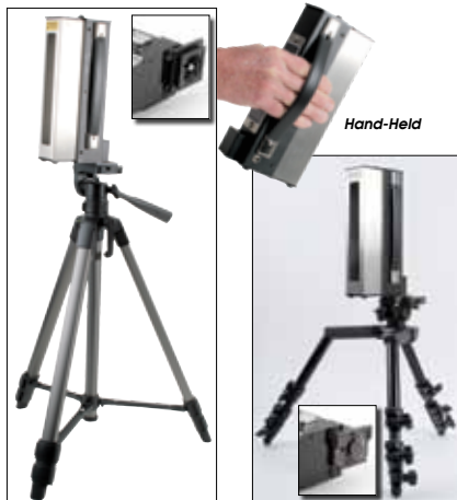
Mounted to optional BM6009 Heavy-Duty Tripod.