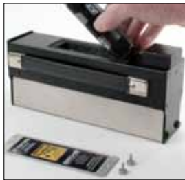
Battery Magazine and Compartment