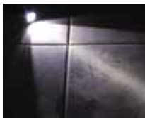
Oblique white light.