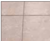
Normal, overhead lighting.