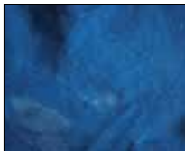
Normal, overhead lighting.

Use the Tactical MAX White Light to scan the crime scene for normally overlooked evidence such as dust prints. The photo (left) shows a tile floor under normal overhead room lighting, while the photo (right) shows the same floor with the room darkened and the floor obliquely lit with white light. Dust prints can now be clearly seen and lifted.