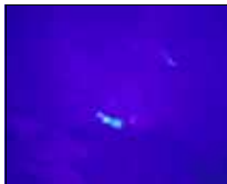
395nm UV light.