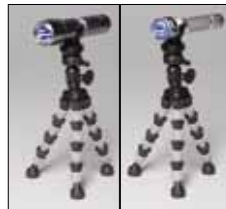
The TMXF1 Tactical MAX Flexible Mini Tripod is compatible with our popular MMX100 and MMX300 series forensic lights.

angles needed for the positioning of the light source. No assembly is required—simply snap the light into the clip at the top of the tripod (shown to the right) and position the light as desired. The TMXF1 is also compatible with our popular MMX100 and MMX300 series forensic lights as shown to the right.