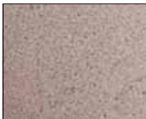
Normal, overhead lighting.

The photo (left) shows a dark-colored sheet lit with normal room lighting. The photo (right) shows the same sheet with the room darkened and lit with the Tactical MAX 395nm UV Light. Suspected physiological fluid stains will fluoresce, making it possible to locate and verify with laboratory testing.