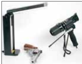
SKSUV13 is paired up with the KRIMESITE™ IMAGER to reveal latent prints on a suspect gun.