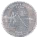
Powder developed latent print is lifted from quarter with intricate detail shown below.