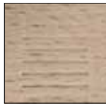
Tool mark left behind in wood is cast using the brown compound of PVS200.