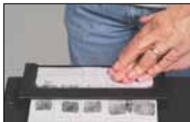
FIG. 6—Position all four fingers at a slight angle and press them onto the record card.