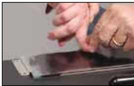
FIG. 2—The subject is positioned so that his/her forearm is parallel to the floor.