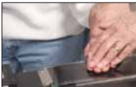
FIG. 5—The four remaining fingers are inked for a plain impression after the thumb has been printed.