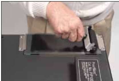
FIG. 1—The operator rolls ink onto the slab.

The following recommended procedure is practiced by the FBI. To avoid possible smearing, always begin the fingerprint taking procedure by inking and rolling the fingers on the right hand.