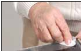
FIG. 4—Then, the operator records the print onto the record card in the space provided.