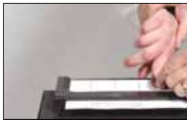
FIG. 3—Next, the operator rolls the subject's right forefinger on the ink slab.