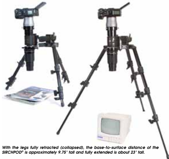
With the legs fully retracted (collapsed), the base-to-surface distance of the SIRCHPOD® is approximately 9.75" tall and fully extended is about 23" tall.

The SIRCHPOD® is shipped with its legs fully collapsed. When in use with a KRIMESITE™ IMAGER system or just a camera, determine the lens-to-subject distance and adjust the legs accordingly. Each leg is equipped with three (3) friction locks that hold the segments in place. By disengaging the locks, the telescoping legs can be adjusted from a minimum base-to-surface distance of 9.75" to 23" when fully extended. Remember to re-engage the locks when the desired height is established.