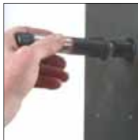
The upper inlet port on the unit is provided for fuming with the CYANOWAND™. It also supports the PUM100 Portable Humidifier should additional moisture be required.

The lower outlet port of the FR600 permits the safe and easy extraction of cyanoacrylate fumes after latent print development is complete by permitting the connection of the FR300 DeFumigator™. It is a self-contained cyanoacrylate filtration system that connects directly to the FR600—simply remove the cap of the lower outlet port and attach the DeFumigator™ to the unit using the hose supplied with the FR300. The noxious odors and fumes inside the chamber are drawn through an efficient filtering system. Removable thumbscrews permit quick and easy access to the filter compartment. For more information on the FR300, contact SIRCHIE Sales at (800) 356-7311 or visit our website: www.sirchie.com .