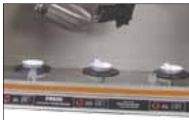
Disposable fuming trays containing OMEGA-PRINT™ are placed on the heating elements.