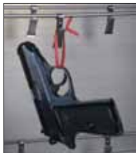
Firearm is suspended from an evidence clip with a twist-tie.