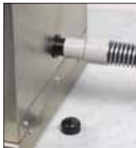
The lower outlet port of the FR600 is provided for the extraction of cyanoacrylate fumes using the FR300 DeFumigator™.