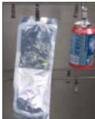
The FINDER™ packet is suspended using an evidence clip.

The Cyanowand™ is a self-igniting, butane-powered heat tool that uses disposable cyanoacrylate cartridges. In most cases, using one of the standard cartridges provides sufficient fuming output.