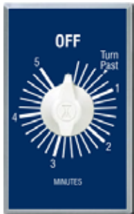
The Timer Control, located on the top of the unit allows for setting the evacuation time.