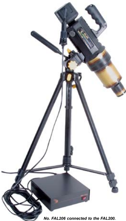
No. FAL206 connected to the FAL200.

The fuse is located in the tip of the Accessory Plug. Unscrew the tip of the plug as shown in Figure 5 to remove the blown fuse. Replace with a 250 volt/6.25 amp glass fuse.