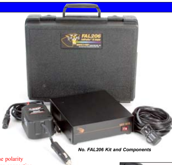
No. FAL206 Kit and Components

This portable AC power source is designed for use with the FAL200 GoldPanther™ Forensic Light Source. The kit (shown above) consists of a 110V AC to 13.4V DC Power Supply, and AC Adapter and the necessary power connection cables. The portability of the FAL206 lends itself to use at the crime scene as well as in the lab. A 220V AC version is available by ordering No. FAL206220.