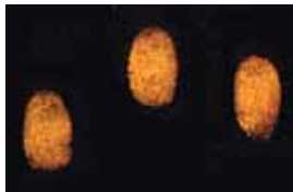
REDESCENT™ LL701 treated prints, excited by BLUEMAXX™ light—exposed for 15 sec. @ f/5.6.