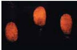
REDCHARGE™ LL601 treated prints, excited by BLUEMAXX™ light—exposed for 4 sec. @ f/8.